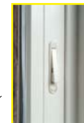
Vent limiters for controlled ventilation