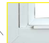
Fully welded frame and sash