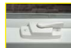
Easy operating cam lock